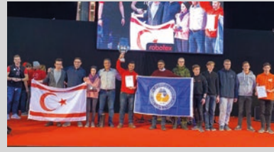
EMU IEEE Robotics Team Wins The "Robotex International" Competition