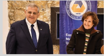
EMU's Art Activities Continue With Günay Güzelgün Exhibition