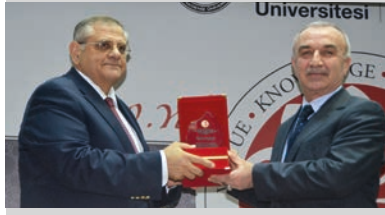
EMU Commemoration Program For Martyrs Week Begins